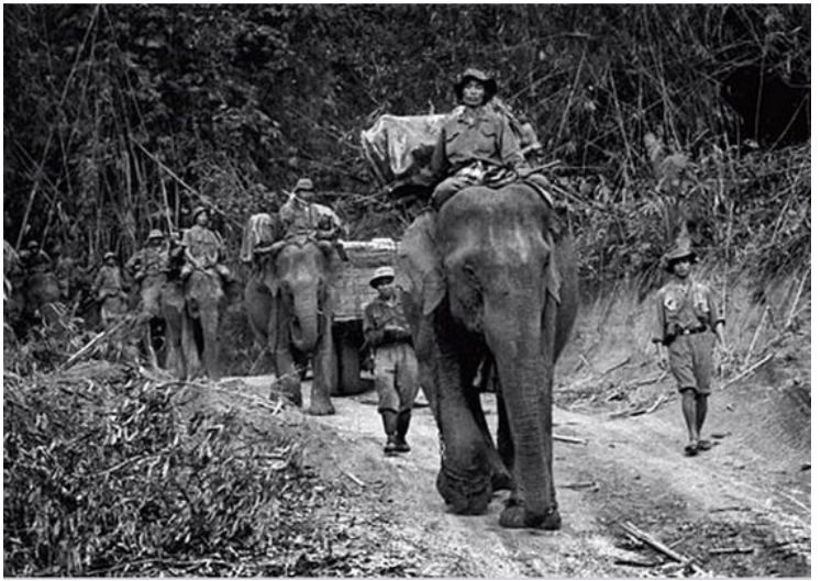
North Vietnamese enemy soldiers with their transport elephants on the Ho Chi Minh Trail

My guess is most elephant kills were on or near the Ho Chi Minh Trail – likely mostly killed by helicopter crews - where elephants were used as enemy beasts of burden. They humped guns, ammo, mortar shells and every other implement and supply of war down the trail on foot, by bicycle, in trucks, in carts pulled by oxen, by elephants and so on. I never saw it myself but I did hear reports of battery-driven headlights on elephants on the trail at night.